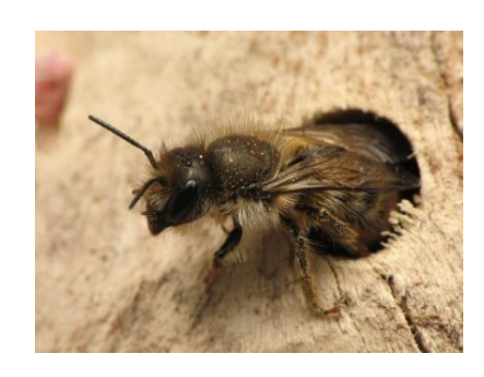
A Mason bee (left) and a common nest of bamboo tubes (right).

The nests are easy to make or get (see below). In fact, now you can even buy mason bees from several of our common honeybee suppliers. So get some or make them a nest and attract some of your own!